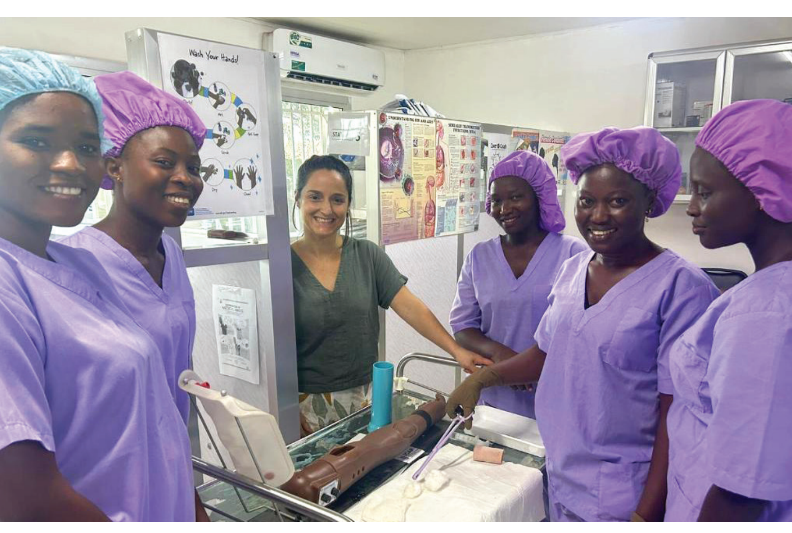
Center for Global Health Year in Review 2023